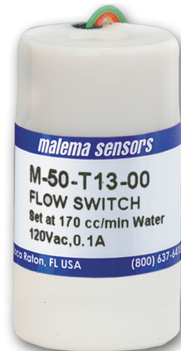
M-50 in PTFE